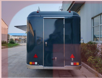
- Door -