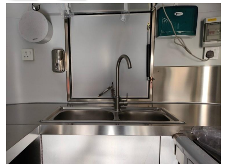
- Sinks -