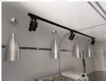
- Lights -